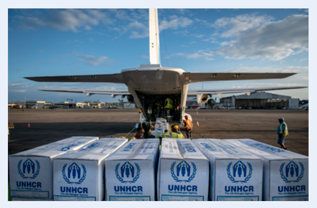
Eight tonnes of humanitarian aid arrives at the airport in Beira, eastern Mozambique for distribution to Cyclone Idai survivors.

Therefore, wherever possible, UK for UNHCR aims to develop fully integrated, shared value corporate partnerships. This approach optimizes the value of our partnerships and boosts UNHCR's progress towards its strategic goals.